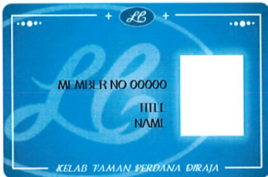
MEMBERSHIP CARD DESIGN 1