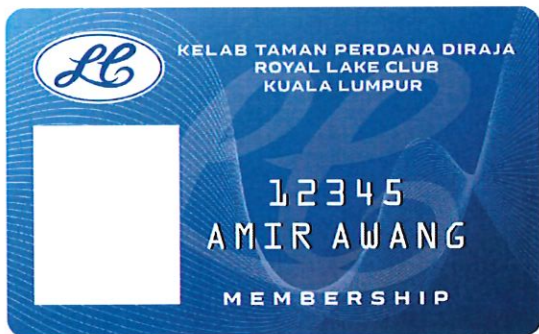
MEMBERSHIP CARD DESIGN 3