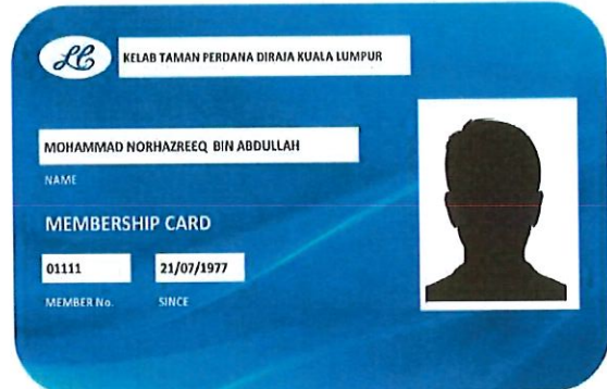
MEMBERSHIP CARD DESIGN 2